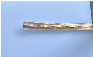
LED strip light Inside