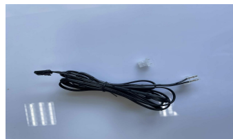
Wire & PC end fitting